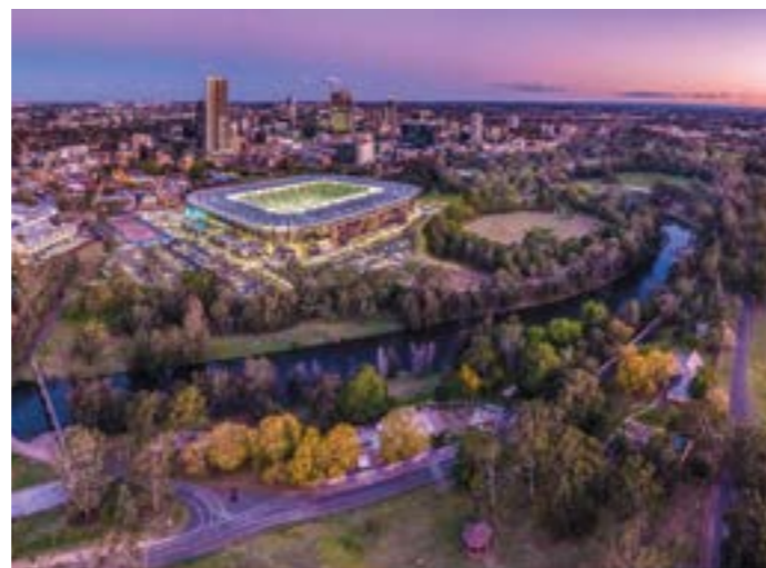
Aerial overlooking the Bankwest Stadium, Parramatta in Western Sydney.

Greater Western Sydney is also home to the largest urban Indigenous population in Australia, which includes the traditional Aboriginal groups – Darug, Gandangara and Tharawal.