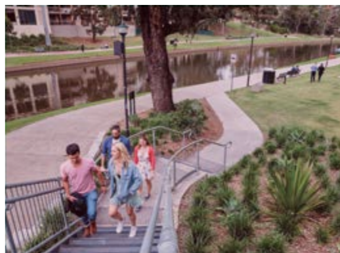
Friends enjoying a walk by Parramatta River in Western Sydney.