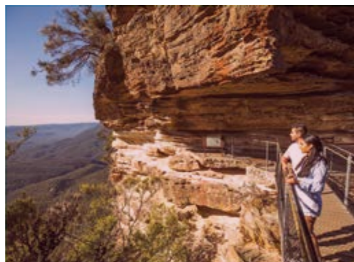
Couple enjoying views from Honeymoon Bridge overlooking the Jamison Valley along the Three Sisters Walking Trail, Katoomba.