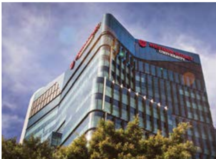
The International College building at 6 Hassall St, Parramatta.