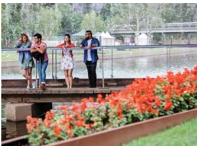
Friends enjoying a walk by Parramatta River in Western Sydney.