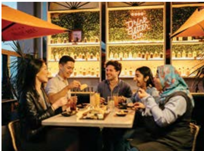
Friends enjoying drinks and food at Nick and Nora's rooftop bar Parramatta.

Greater Western Sydney is also home to the largest urban Indigenous population in Australia, which includes the traditional Aboriginal groups – Darug, Gandangara and Tharawal.