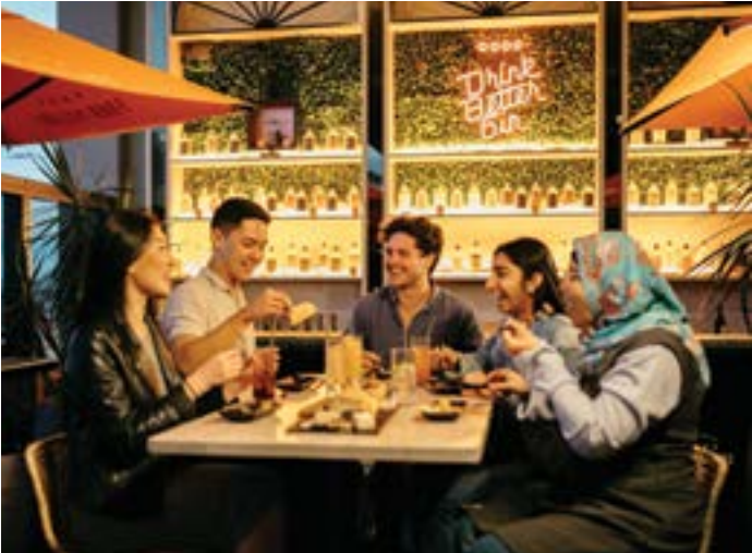
Friends enjoying drinks and food at Nick and Nora’s rooftop bar Parramatta.

Greater Western Sydney is also home to the largest urban Indigenous population in Australia, which includes the traditional Aboriginal groups – Darug, Gandangara and Tharawal.