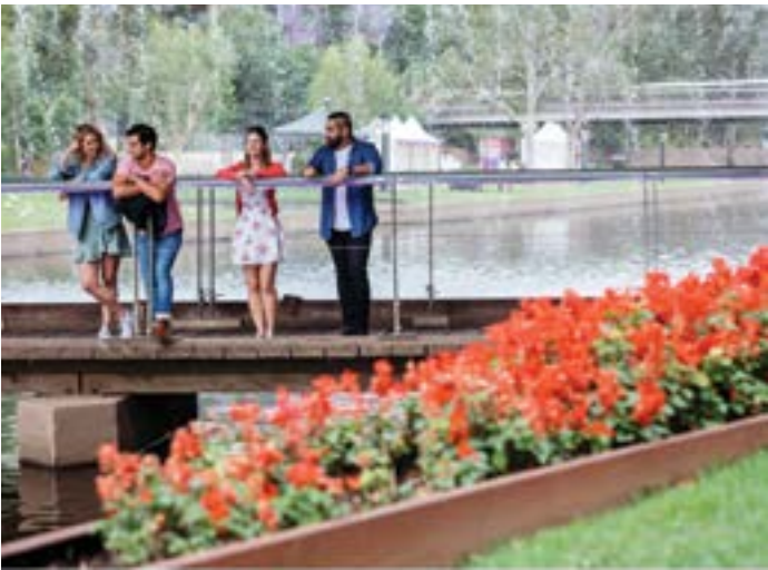
Friends enjoying a walk by Parramatta River in Western Sydney.