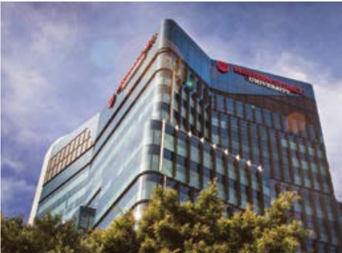
The International College building at 6 Hassall St, Parramatta.